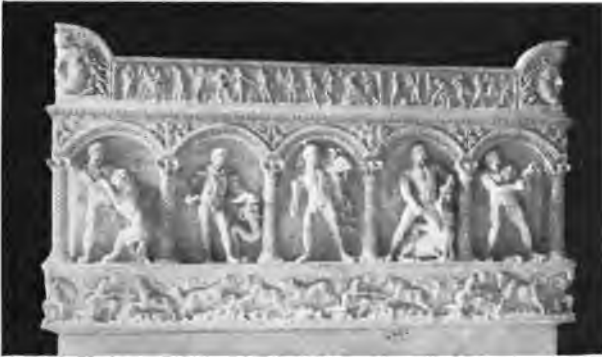
Fig. 66. Five of Heracles' Labors.

still hated Alcmena's son, sent a cursed madness upon him so that he threw his own children into the fire. Seeking purification from his crime, he left his country and his wife and journeyed to Delphi. The god commanded that he should serve his cousin Eurystheus and so make atonement. Thus, as Hera had planned, Zeus's son became the servant of Eurystheus, at whose bidding he performed twelve great labors. The